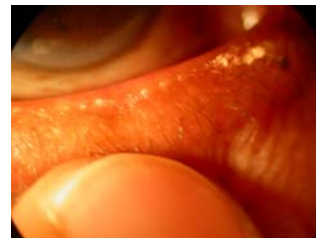
Posterior blepharitis with eyelid margin inflammation with excess secretions from the meibomian glands, as well as telangiectatic vessels and irregularity of the eyelid margin.