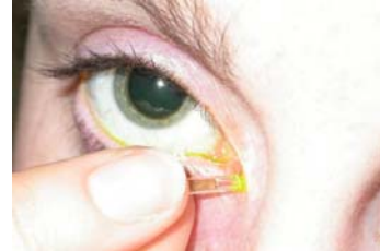
The glass Lester Jones Tube sits in the inner corner of the eye and drains tears from the eye into the nose.

In cases where the canaliculi are damaged, a Lester Jones tube can be inserted to drain the tears from the eye into the nose. This requires particular care to make sure that it stays in the correct position and remains clean.