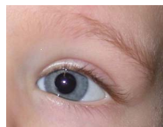
Increased tears in the left eye.

Congenital watering of the eye is due to the naso lacrimal duct not being fully open. Most tear ducts open by the age of 1 year. If watering continues beyond this stage then probing of the tear duct is required to try to relieve the blockage.